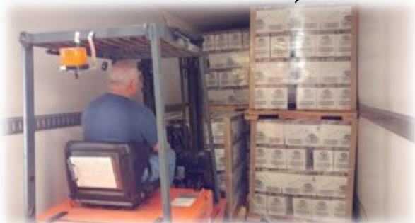
Unloading 30 skids of dried potatoes

https://www.canadahelps.org/en/charities/ontario-christian-gleaners/