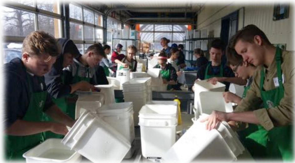
Youth from Bradley Street Church of God washing pails in preparation for shipping Gleaners food products

We are so thankful to the Gleaners for welcoming youth groups, and for the mission that they have to feed the hungry in our world. May the Ontario Christian Gleaners and everyone who serves and works there continue to feel blessed as they make a difference in hungry people's lives!